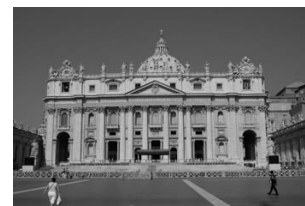
Basilica of Saint Peter Vatican City Rome

Round Trip Airfare & Hotel Transfers 19 Meals Included with Special Welcome & Farewell Celebrations Baggage Handling & Portage at First Class Hotels.