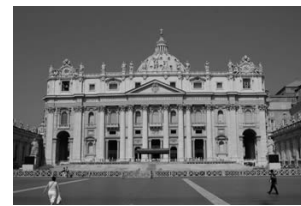
Basilica of Saint Peter Vatican City Rome

Round Trip Airfare & Hotel Transfers 19 Meals Included with Special Welcome & Farewell Celebrations Baggage Handling & Portage at First Class Hotels.