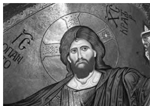
Mosaic of Christ Pantocrator in the apse of Monreale Cathedral Sicily