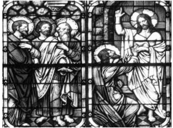
"My Lord and my God!" FOUND IN THE NAVE OF THE CHURCH

St. Thomas, our parish patron Saint, was one of the Twelve Apostles. He was a Jew from Galilee called by Jesus to accompany him on his mission to proclaim the kingdom of God. When Jesus' life was threatened as he went to raise Lazarus from the dead, Thomas said to the others, "Let us also go, that we may die with Jesus'.