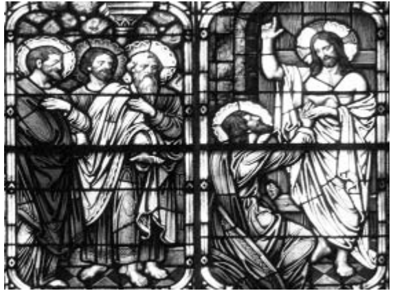
"My Lord and my God!" FOUND IN THE NAVE OF THE CHURCH

St. Thomas, our parish patron Saint, was one of the Twelve Apostles. He was a Jew from Galilee called by Jesus to accompany him on his mission to proclaim the kingdom of God. When Jesus' life was threatened as he went to raise Lazarus from the dead, Thomas said to the others, "Let us also go, that we may die with Jesus'.