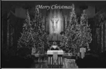
St. Thomas Altar (1) 5 1/2 (H) 8 1/2 (W)