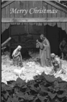
St. Thomas Manger (2) 8 1/2 (H) 5 1/2 (W)