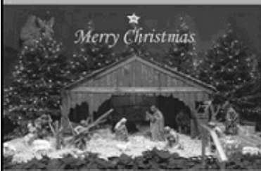
St. Thomas Manger (3) 5 1/2 (H) 8 1/2 (W)