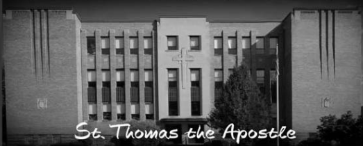
St. Thomas the Apostle

Don't Miss The 40th Reunion of the Class of 1971