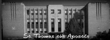
St. Thomas the Apostle

Don't Miss The 40th Reunion of the Class of 1971